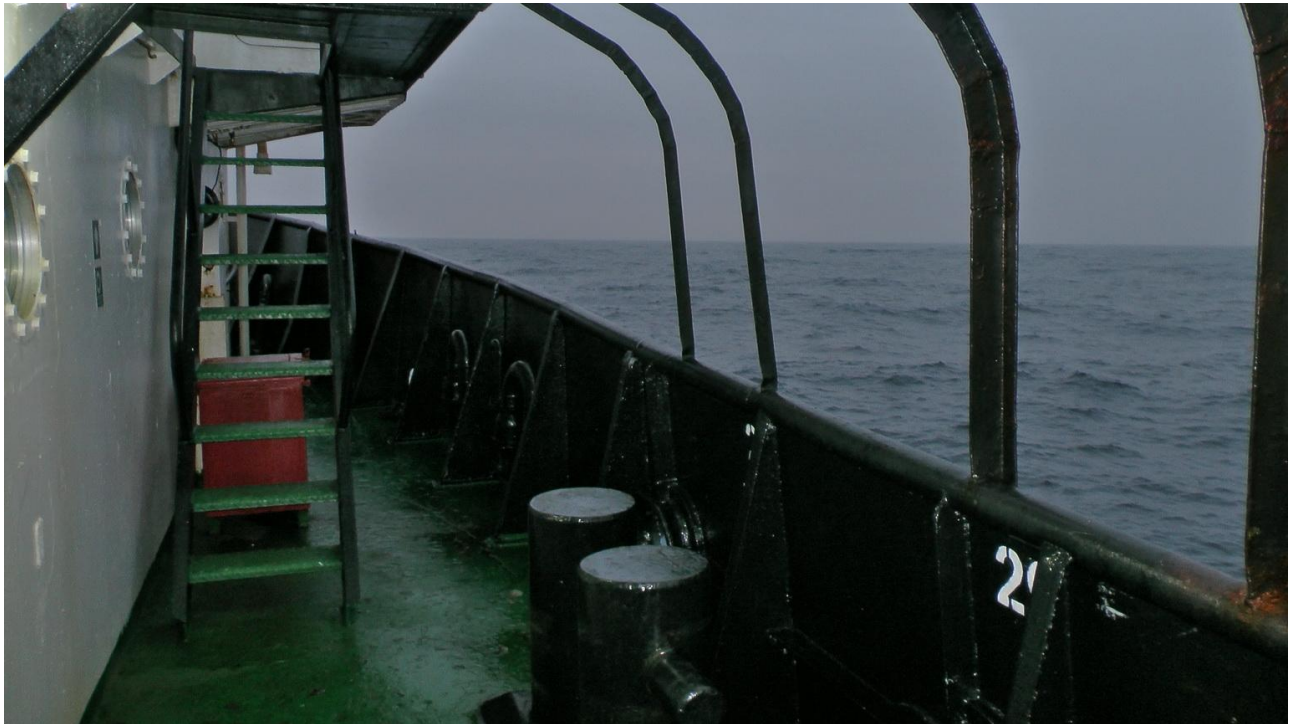
Figure 3. The standard height of the ship side visible from the main deck of the ship.

Other ships within the same fishing area were informed about the disappearance of a man on "Karalius" ship via ultrashort-wave radio station Channel 16 and medium-wave 2182 kHz radio stations. The Murmansk Rescue Coordination Centre was notified and undertook onshore management of ships "Morskoi Briz", "Start", "Kalmar" and "Norvag" searching for the disappeared person. In the sea, the search actions of these ships were coordinated by the captain of "Karalius" ship. Various schemes for searching for the man in the sea were applied but they yielded no results during an 18-hour search. The Murmansk Rescue Coordination Centre recommended that the search should be discontinued already after 8 hours as, according to doctors, under the prevailing weather and sea water conditions, the man could have remained in the water alive for approx. 3 to 5 minutes.