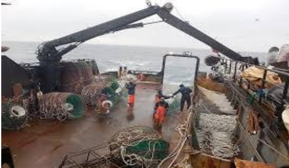
Figure 1. The ship is prepared for the voyage.

The crew consisted of 28 people including the captain of the ship.